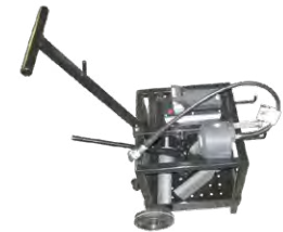
With Install Basket

Application: Makes transportation and storage of the DGC80T and accessories easy and convenient. Model: DGC80T