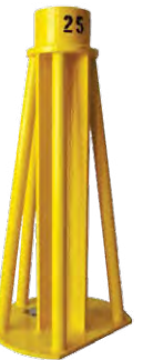
Corner 25 Ton Steel Stand 41" - close fit