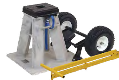
Center Sill 80 Ton Stand 24" or 31" with 6", 12", 18" extensions.