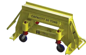
Support 50 Ton Stand 30.75"