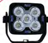
2 HYD-SP540 4" Square Flood LED Work Light

2x Front Facing (One on each front fender mounted light box) 2x Top Forward/Side Facing (One on each front corner of cabin)