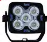
2 HYD-SP540 4\" data-bbox="471 670 634 717"/>

2x Top Front Facing (One on each front corner of cabin)