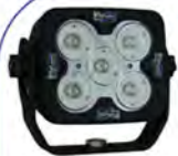
1 HYD-SP520 4" Square Spot LED Work Light

2x Front Facing (One on each front fender mounted light box) 2x Top Forward/Side Facing (One on each front corner of cabin)