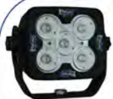
1 HYD-SP520 4\" data-bbox="169 670 324 717"/>

2x Front Facing (One on each front fender mounted light box)