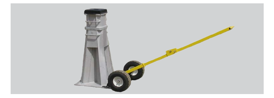
Aluminum Stand Wheel Assembly