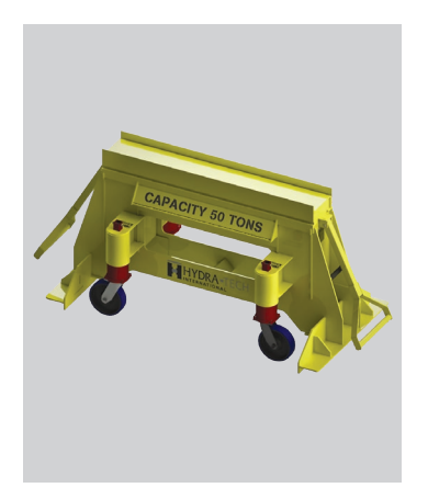
Support 50 Ton Stand