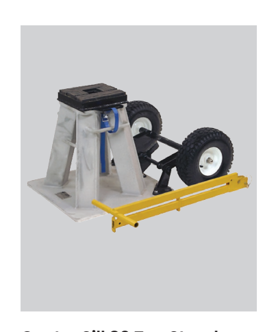
Center Sill 80 Ton Stand 24" or 31" with 6", 12", 18" extensions.