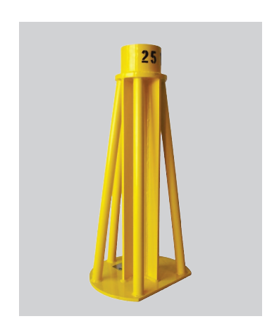
Corner 25 Ton Steel Stand