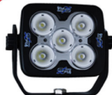
2 HYD-SP540 4" Square Flood LED Work Light

2x Front Facing (One on each front fender mounted light box) 2x Top Forward/Side Facing (One on each front corner of cabin)