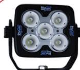
2 HYD-SP540 4" Square Flood LED Work Light

2x Front Facing (One on each front fender mounted light box) 2x Top Front Facing (One on each front corner of cabin)