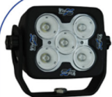
1 HYD-SP520 4" Square Spot LED Work Light

2x Front Facing (One on each front fender mounted light box) 2x Top Forward/Side Facing (One on each front corner of cabin)